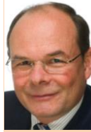
Gerhard A. Holzapfel TU Graz, Austria & NTNU, Norway

Machine learning and data-driven modeling in biomechanics; Constitutive Artificial Neural Networks (CANNs); growth and remodeling of soft biological tissues (physiological foundations, experimental observations, mathematical and computational modeling); biomechanics of the stomach (mechanics, electrophysiology, brain-stomach axis)