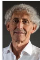
Alfio Quarteroni Politecnico di Milano, Italy

Continuum mechanics essential for constitutive modeling of soft biological tissues; fiber-reinforced materials, fiber dispersion: the role of planar biaxial tests in characterizing material properties; residual stresses and their influence on material response; some modeling pitfalls